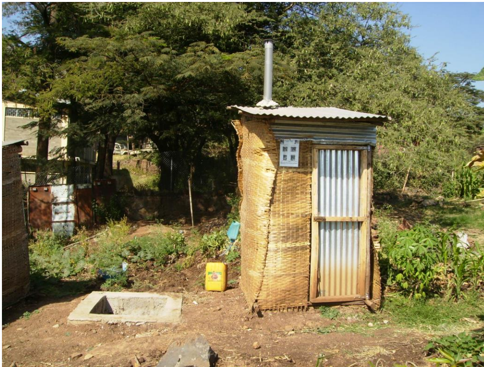
Figure 2: Fossa Alterna